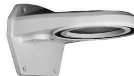
DB243W2 Wall Mount, White