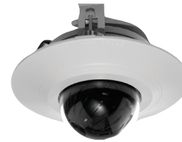
CV-FLUSHMT Flush Mount

Mounting hole sized for 3/4" conduit connector