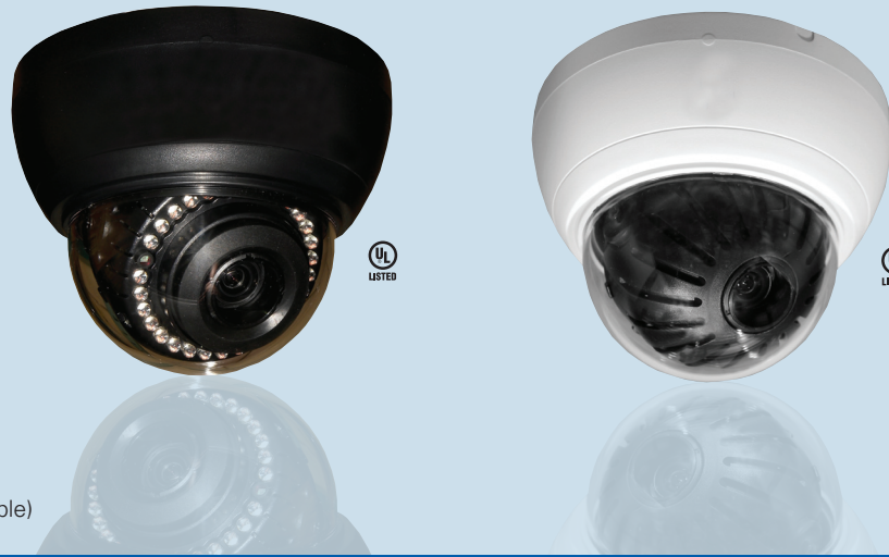
(Black IR model and White non-IR model shown; opposite colors available)