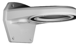
DB243W(B) Wall Mount, White

Mounting hole sized for 3/4" conduit connector