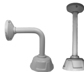
VDMWC Wall Mount & VDMWC Ceiling Mount