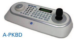
A-PKBD Keyboard Controller