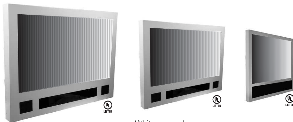
White case color